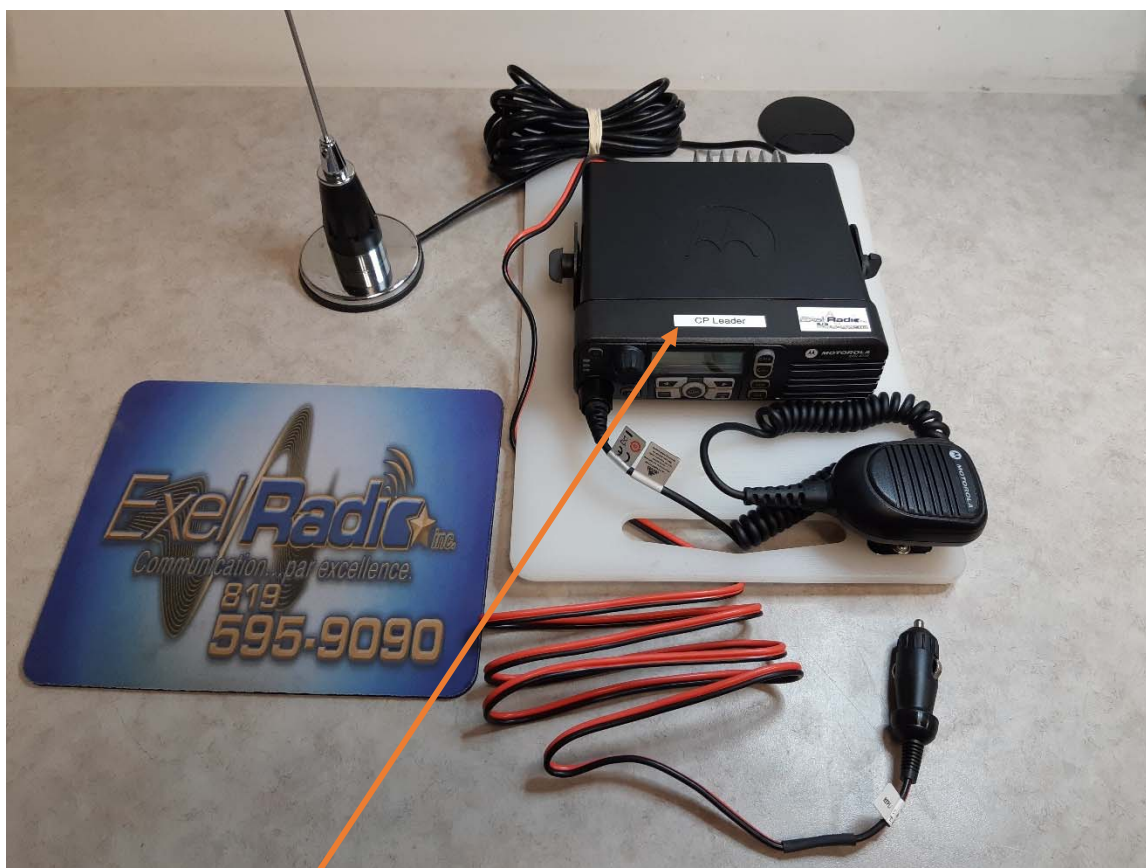
Radio identification sticker

Each radio has a unique identification sticker with the user's role/callsign.